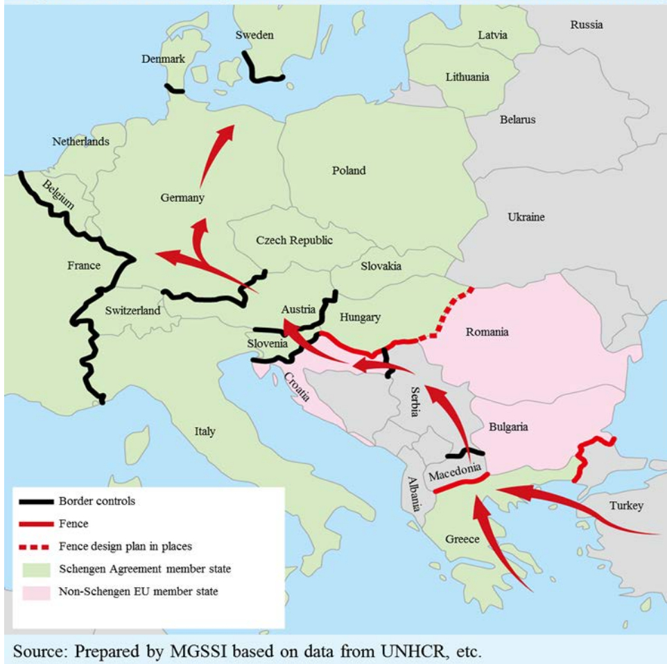
Fig. 2: Flow of refugee status seekers (Western Balkan route)