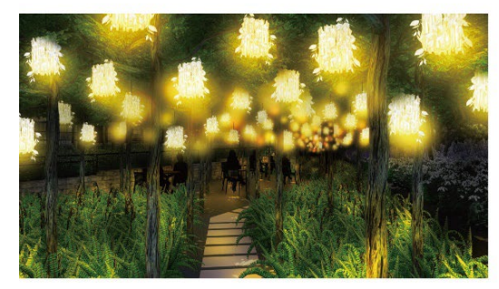
Illumination display *Pictured is an artist's rendition, and the actual display may differ from that shown.