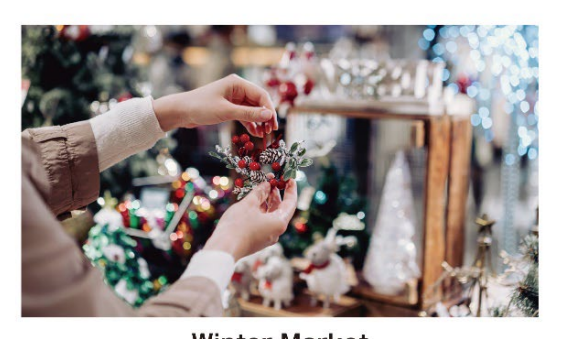
Winter Market **Pictured is an artist's rendition, and the actual display may differ from that shown.