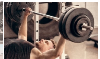
Free weight training space

*There is also a makeup area exclusively for females.