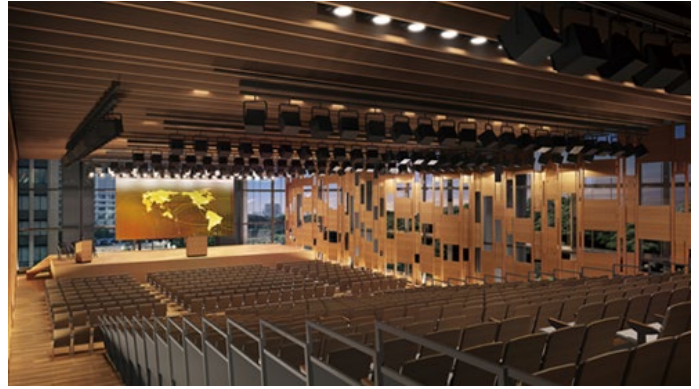
Artist's impression of the Otemachi Mitsui Hall in use (2)