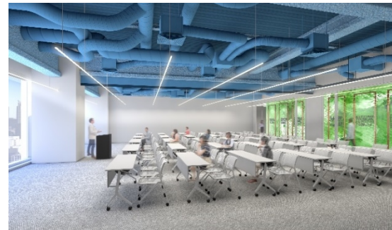
A large meeting room

*Seating numbers are based on school-style layouts.