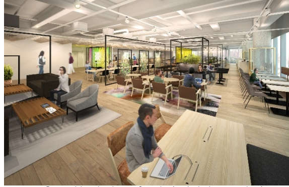
Coworking in the cafeteria (artist's impression)