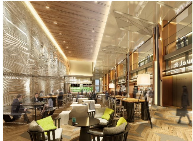
Artist’s impression of the commercial area of Otemachi One