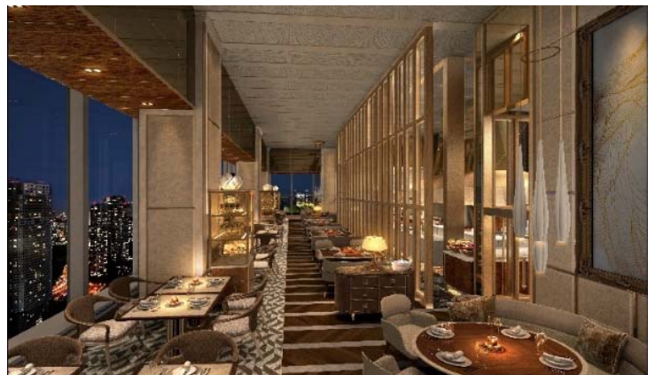
Artist's impression of a restaurant