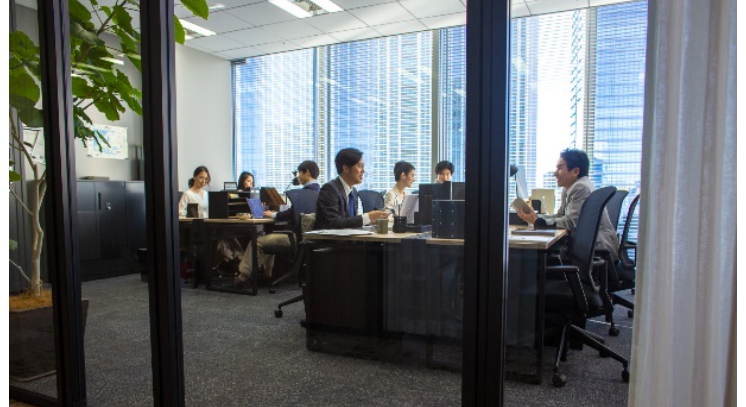
WORK STYLING "FLEX" (Impression)