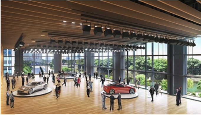
Artist's impression of the Otemachi Mitsui Hall in use (1)