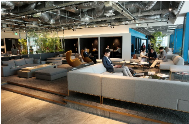
WORK STYLING "SHARE" (Impression)