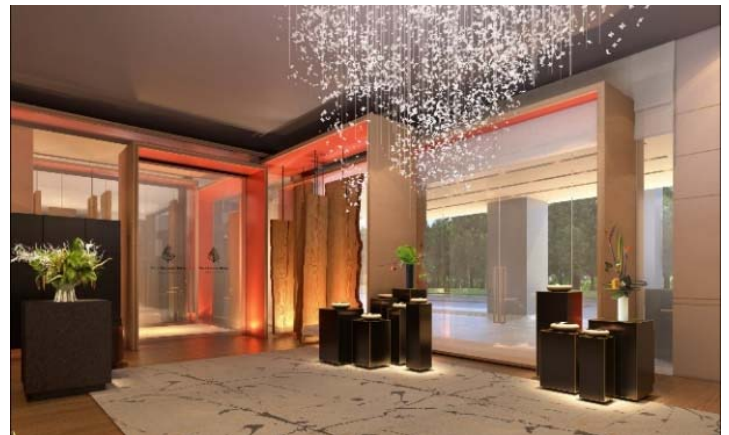
Artist's impression of the entrance