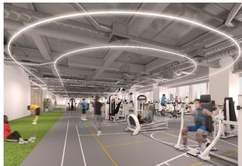
Exercise machine area