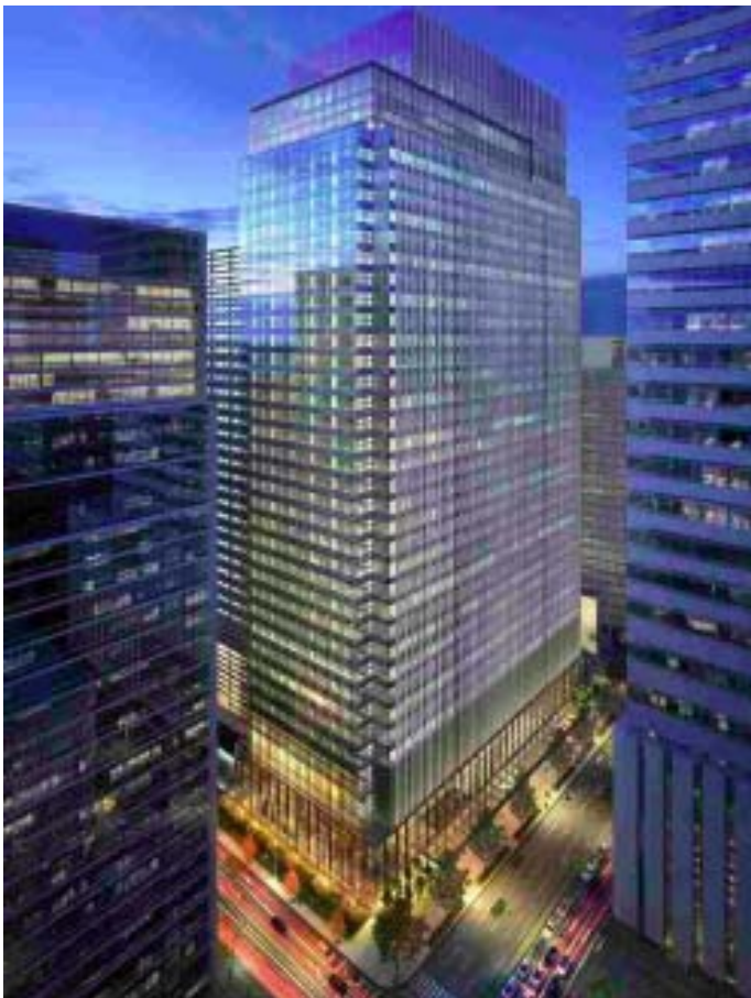
Artist's impression of the exterior