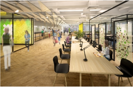
Lunchtime in the cafeteria (artist's impression)