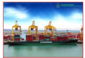
Thailand Evergreen Container Terminal (49%)