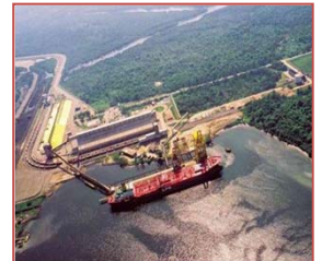
Brazil VLI (20%)