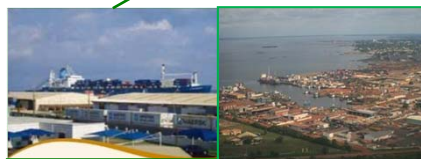
Gabon Gabon Port Management Libreville & Port Gentil (100%)