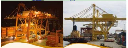
Indonesia Terminal 009 (51%)