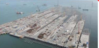
Indonesia Container Terminal One