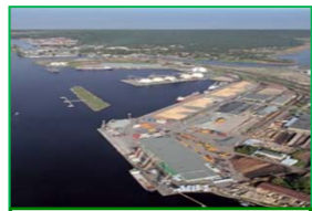
Latvia Riga Universal Terminal (80%)