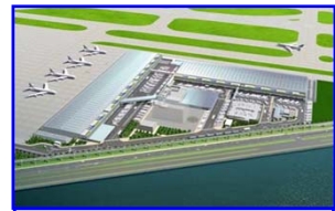
Japan Tokyo International Air Cargo Terminal (100%)