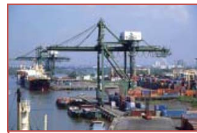
Vietnam Vietnam International Container Terminal (15.7%)