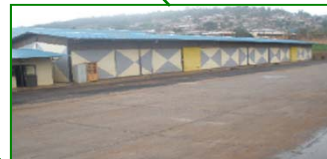
Rwanda Magasins Generaux du Rwanda <INLAND> (75%)