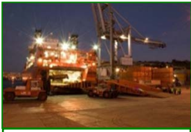
Malta Valetta Gateway Terminal (55%)