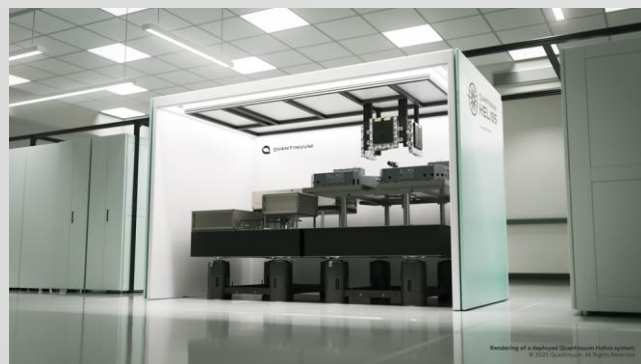
Quantinuum's new quantum computer, "HELIOS"