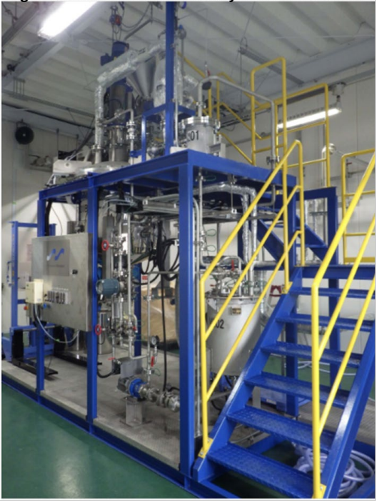
Figure 3: Demonstration facility for monomerization of acrylic resin

Microwave Chemical (Japan) is one of the few companies in the world with a proven track record of scaling up microwave reactors. The company is considering monomerization of automotive shredder dust and thermosetting sheet molding compound in collaboration with Mitsui Chemicals, and monomerization of acrylic resin in collaboration with Mitsubishi Chemical. Figure 3 shows a photograph of a demonstration facility for the monomerization of acrylic resin.