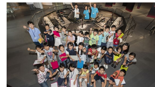
Participants visiting the National Museum of Emerging Science and Innovation

As a result of presentations at academic conferences and other venues, these sustainability education initiatives by Mitsui have attracted considerable interest and praise as progressive examples of education for sustainable development (ESD). In the fiscal year ended March 2017, the program was selected by the Japan Association for Human and Environmental Symbiosis for its environmental activity award, and also won the Judging Panel's Incentive Prize in the Corporate Youth Experience Promotion Awards of the Ministry of Education, Culture, Sports, Science and Technology (MEXT).