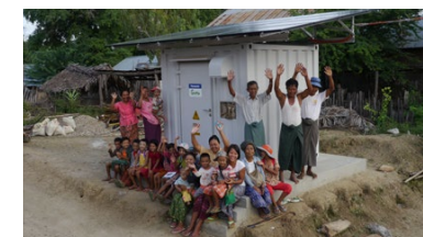
Solar power generation facility and local residents

Funds donated through this program to the Mae Fah Luang (MFL) Foundation in the fiscal year ended March 2015 were used to install a solar power generation system manufactured by Panasonic Corporation in Yin Ma Chaung, a village in the Magway Division of Myanmar. The provision of this stand-alone electricity generator with support from Mitsui has enabled this village to take the first step toward becoming an independent, self-supporting community.