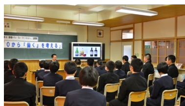
Visiting Lecture Project

We are also supporting the "English Conversation Class Project" for junior and senior high school students at a "Collaborative School" run by Katariba, a certified non-profit organization, in the town of Onagawa, Miyagi Prefecture. Many children in Onagawa are currently living in temporary housing and have limited opportunities to attend coaching schools and extracurricular classes. The three curricula offered through our project are designed to awaken children's interest in different cultures and values and broaden their knowledge through the study of English. The students develop useful English-speaking ability through on-line conversational English classes via Skype provided by RareJob, Inc., a company with which Mitsui has a capital and business alliance. They also experience the wider world through a short-term summer study travel program in Japan. Under the career education class, students hear about personal stories of various overseas experiences from Mitsui staff acting as voluntary teachers. This encourages them to think about a future in which they can make use of the English they have learned. A total of 62 students have participated since the inception of the program in the fiscal year ended March 2015.