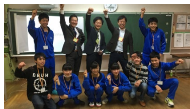
English Conversation Class Project