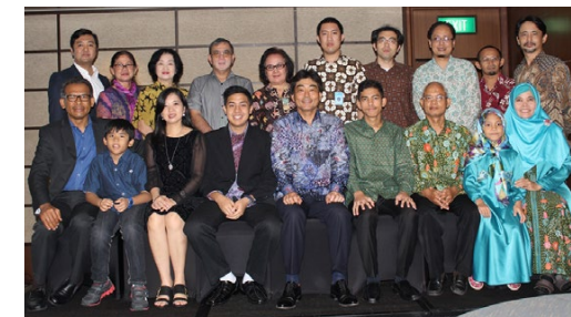
Send-off party for the 19th scholarship intake in Jakarta

By the end of the fiscal year ended March 2017, a total of 40 people had been accepted under this program since its inception. Twelve are currently enrolled. Scholarship programs are also operated by the Mitsui Bussan Trade Promotion Foundation and the Mitsui U.S.A. Foundation.