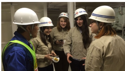
Russian students learn about the activities of Kanda Shipbuilding in Hiroshima.

Mitsui has endowed lecture programs at John Carroll University, the City University of New York, and Columbia University in the United States, Peking University and Fudan University in China, and the University of Warsaw in Poland.