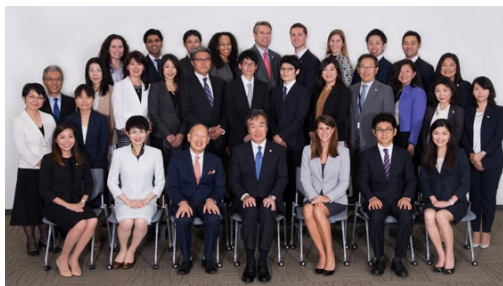
Members of the Japanese and American delegations for 2016

In this program, 10 young professionals selected from Japan and 10 from the United States spend approximately one week visiting each other's countries. In addition to networking among delegates, there are also opportunities for dialogue with government officials, top business executives and young leaders, and tours of local sites. These activities allow participants to broaden their perspectives and knowledge and build diverse networks in preparation for their future global leadership roles. A cumulative total of 79 people have participated in the Japanese and American delegations.