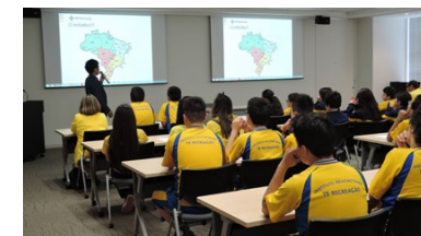
An extracurricular class held at Mitsui Headquarters

In addition, Mitsui supports a total of 14 NPOs that provide consultation services for general life issues affecting Brazilians living in Japan, including health and education problems.